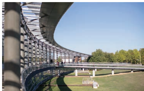
Northern campus Futuroscope