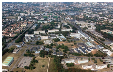
Southern campus Poitiers